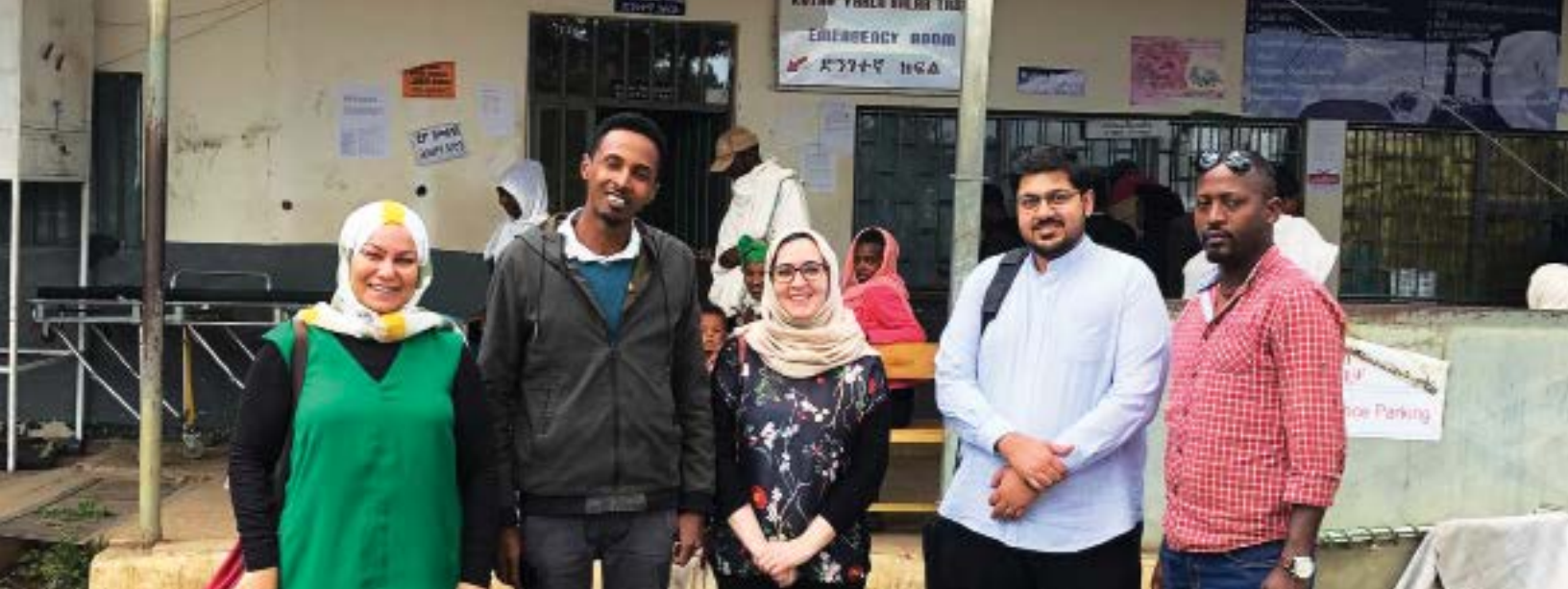
Partnership and Collaboration between Fitch Hospital staff, CPAR staff and Canadian volunteers